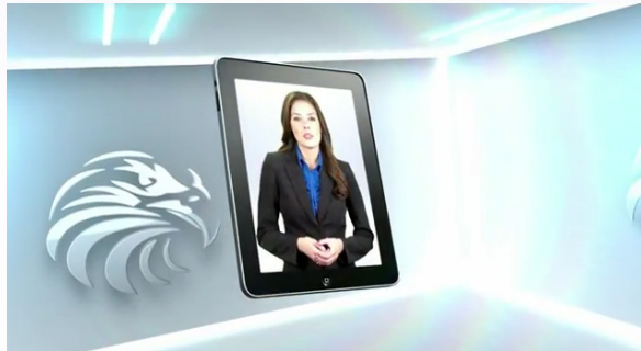
This is the actual thumbnail for one of our videos on YouTube (the thumbnail is generated by YouTube).

on the right is the same video with a customized thumbnail on our website. Which one would you be more inclined to click and watch?