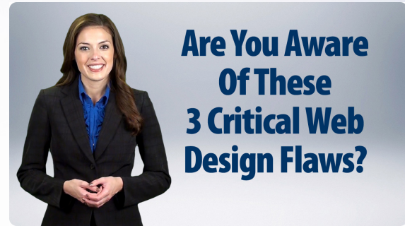
This is the EXACT SAME video hosted on our website with a customized thumbnail. (Yes, it has rounded corners on the video.)

At Rocket Social Marketing, we host our client's videos for them and triple encode all of our videos for our clients so that they play back seamlessly in HD (high definition), SD (standard definition), and on mobile devices without forcing visitors to leave the page. And yes, they work perfectly on iPads and iPhones, everytime—even when streaming over cellular networks. Additionally, we always custom create a video thumbnail so that visitors to your website will want to push play and actually watch your video.